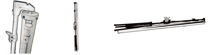
9 10 11