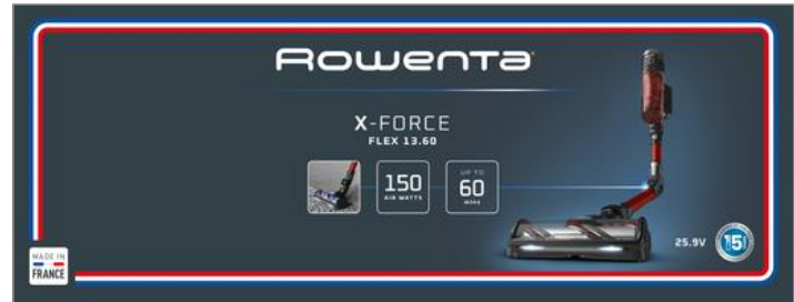
X-Force Flex 13.60, Cordless Stick Vacuum Cleaner, Animal Model, Deep-Cleaning Power aspirateur versatile RH9A73WO