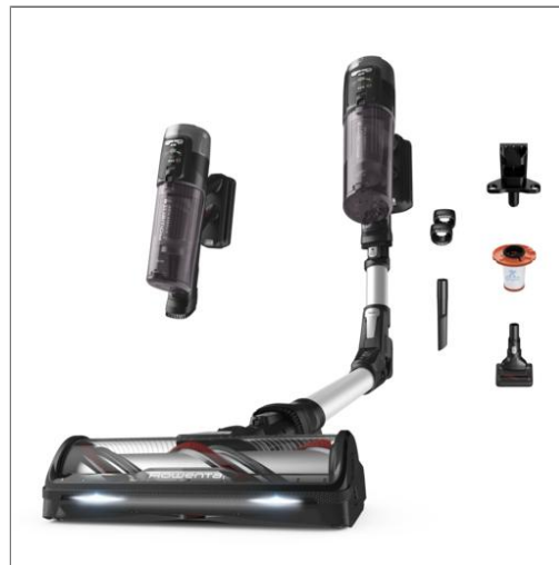
X-Force Flex 13.60, Cordless Stick Vacuum Cleaner, Car Model, Deep-Cleaning Power VERSATILE HANDSTICK RH9A46WO