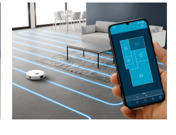
Smart navigation and permanent map

The robot automatically empties its dust box after each cleaning session for up to 60 days of peace of mind.