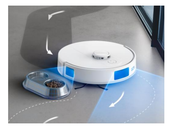
Low obstacle detection and avoidance

No need to tidy up your home before cleaning, with low obstacle detection and precise avoidance to avoid getting stuck.