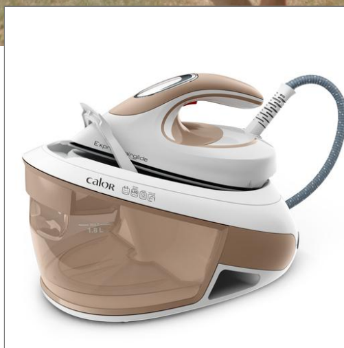
Express Airglide Steam Generator Iron SV8027C0