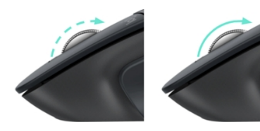
Switch modes manually

You can also manually switch between modes by pressing the mode shift button.