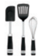
Tools and Gadgets

Cuisinart offers an extensive assortment of top quality products to make life in the kitchen easier than ever. Try some of our other countertop appliances, cookware, tools and gadgets.